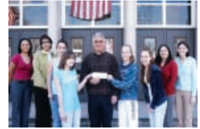
Island Trees Middle School National Jr. Honor Society did a candy sale