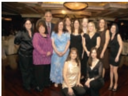
Parents & friends of the Gala Committee