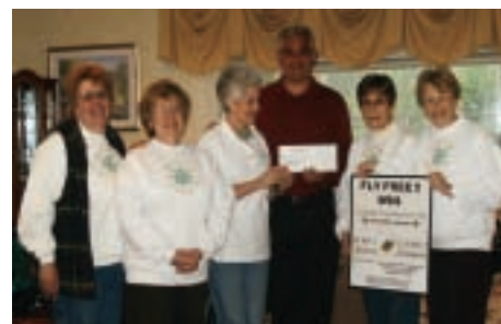
The Sayville Pilot Club helps Angela's House