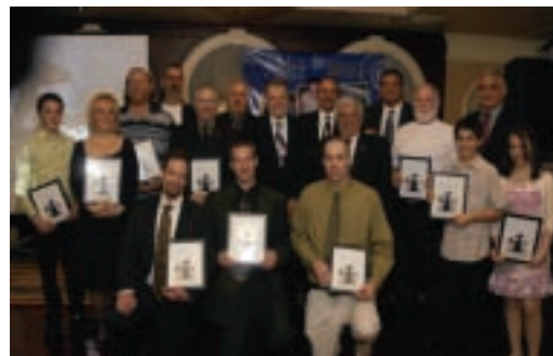
The volunteers are honored for helping to bring the Angel of Hope to Long Island