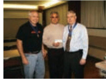
The Ancient Order of Hibernians Division 3 presents a donation