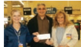
Walmart makes a donation