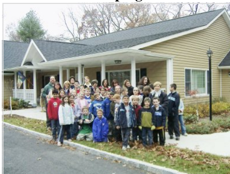
Forest Brook Elementary visits Angela's House to help with yard work

Donations can be sent to: ATDC PO Box 5052 Hauppauge, NY 11788 ATDC is a 501(c)(3) non-profit organization; your gift is tax deductible to the full extent of the law.