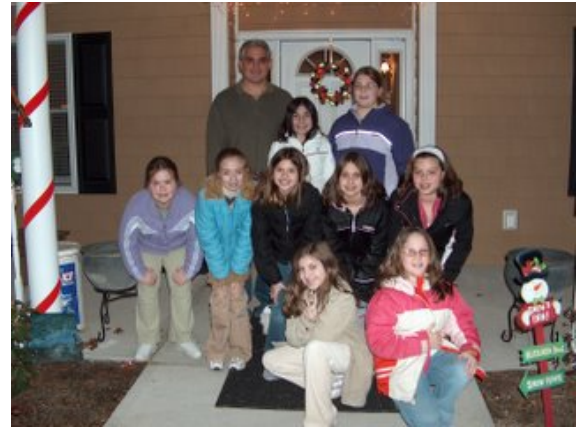
Girl Scout Troop 1249 visits Angela's House